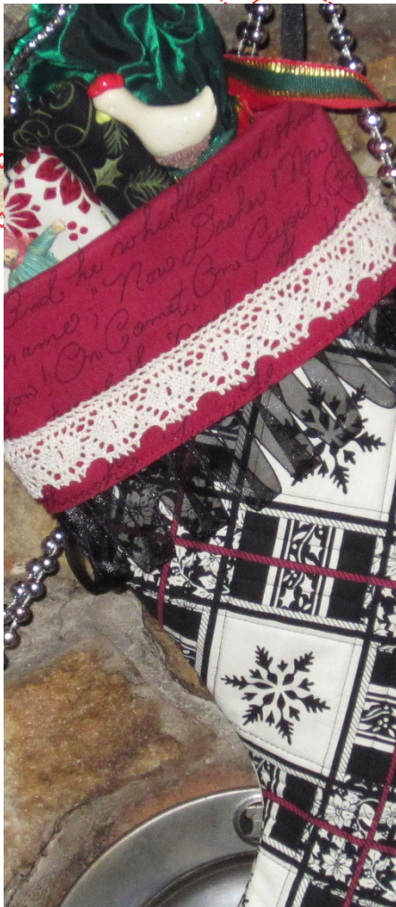
created by Lisa Klingbeil finished size = 12" x 12"