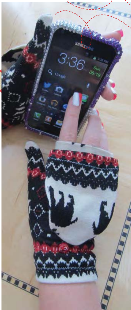
Created by Stacy Schlyer