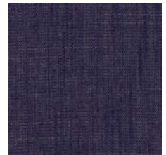
DEN-T-3000 BLUEBOTTLE FIELD