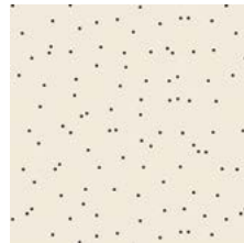
HBR-5433 FIREFLY WHISPER