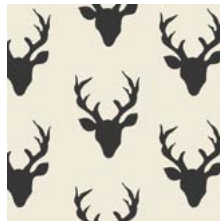
C-5434 BUCK FOREST