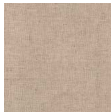
DEN-L-4000 SOFT SAND