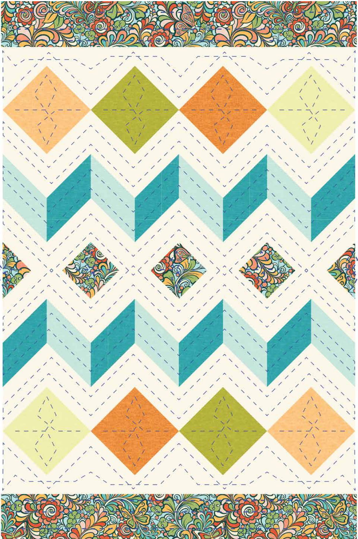
Thread Basting Diagram