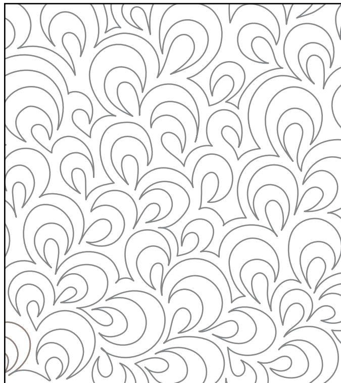
Open Petals Fill