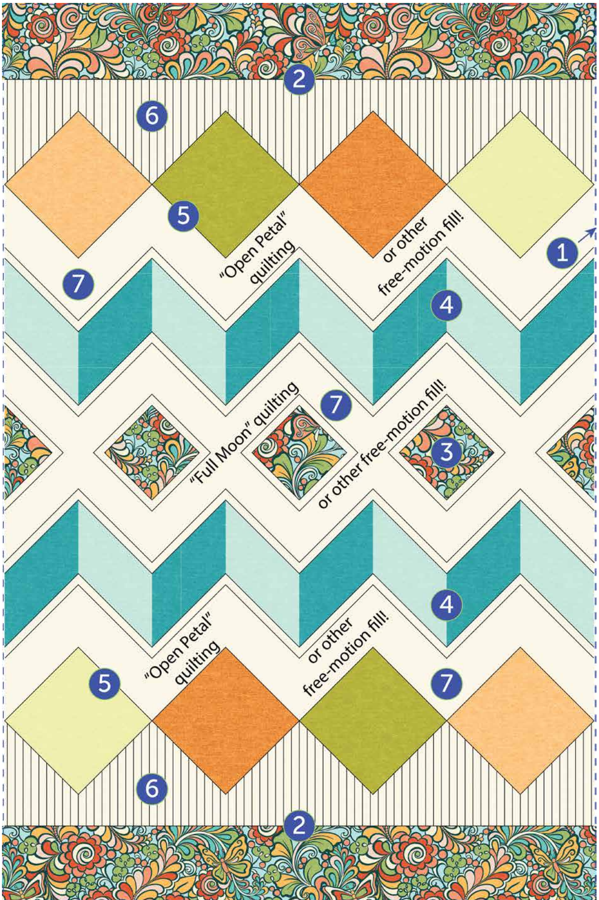
Quilting Order - Month 1