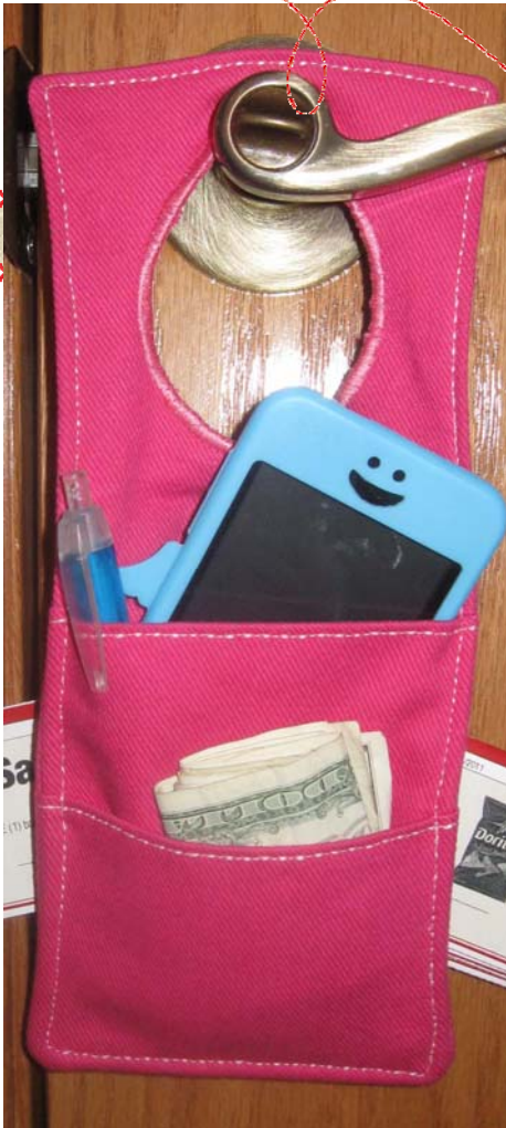
created by Stacy Schlyer