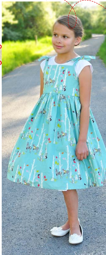
Created by Simple Simon & Co.